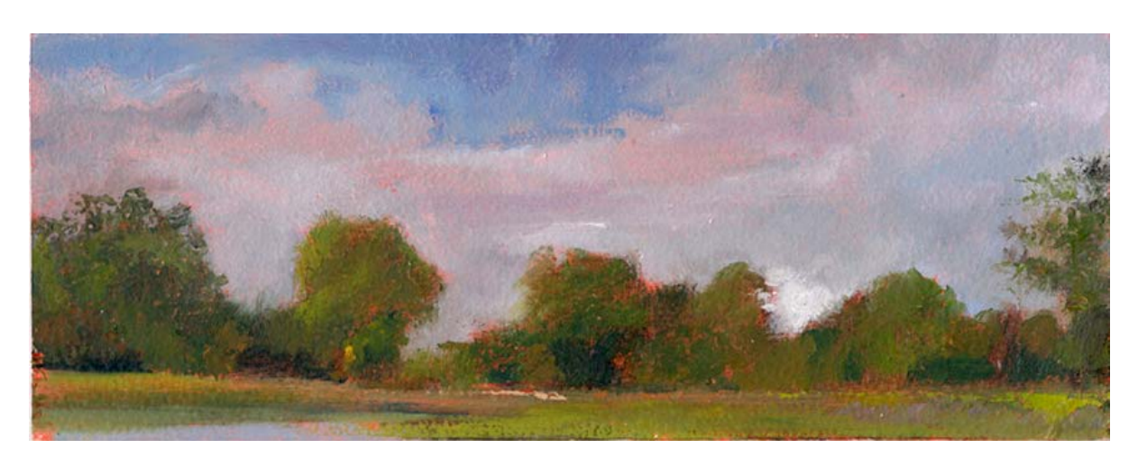
Plein Air Sketch